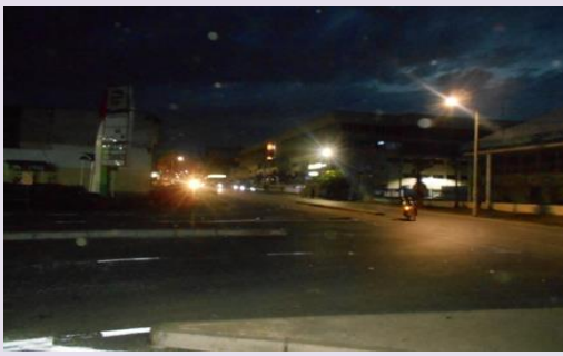
The Move of The Holy Spirit